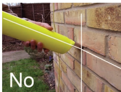
2. Nozzle is incorrectly seated